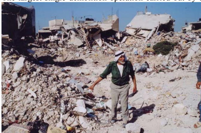
Man pointing at the rubble of his destroyed house in Jenin refugee camp, April 2002.

The largest single demolition operation carried out by the Israeli army was in Jenin refugee camp in April 2002. The army completely destroyed the al-Hawashin quarter, an area of 400 x 500 meters, and partially destroyed two additional quarters of the refugee camp, leaving more than 800 families, totaling some 4000 persons, homeless. 17 In the course of this and other Israeli army offensives there was considerable armed resistance by Palestinians, and the Israeli authorities claimed that the army destroyed the area in the course of combat with Palestinian gunmen.