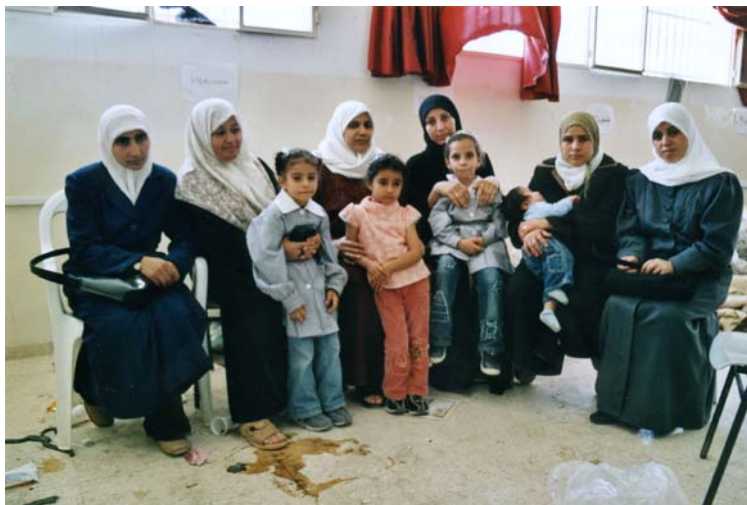
These women and children were made homeless when the Israeli army destroyed a seven-storey apartment building in Nablus on 5 September 2003. After the destruction they had to move in with relatives.

so after dark; how can we know who comes in and out of the building? It was a big building. We had saved for 14 years to buy this apartment; it was fully equipped and we had lived in it less than a year. Now we have nothing, all our furniture, clothes, documents, money, the children's school bags, our photographs, everything got buried in the rubble. The children have been traumatized by what happened, they saw their home destroyed, and every day they see the rubble of their home and don't have a