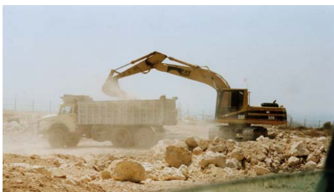
A US-made Caterpillar bulldozer is destroying land to build the fence/wall near Ras Atiya, West Bank .

depths. To date less than half of the route has been completed, mostly in the northern regions of the West Bank and around Jerusalem. In addition to the large areas of particularly fertile Palestinian farmland that have been destroyed, other larger areas have been cut off from the rest of the West Bank by the fence/wall. According to the Israeli authorities the fence/wall is intended to block entry into Israel to Palestinian suicide bombers and other potential attackers. However, the fence/wall is not being built between Israel and the Occupied Territories but