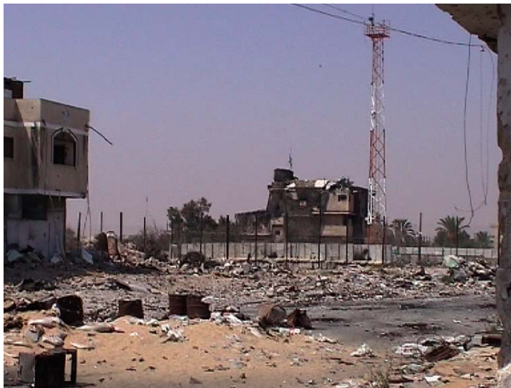
House demolition in Rafah refugee camp. © AI, July 2001

"the rhythm of shelter destruction in the Gaza Strip increased significantly" 23 and that UNRWA "was not able to keep up with the pace of shelter destruction" . 24