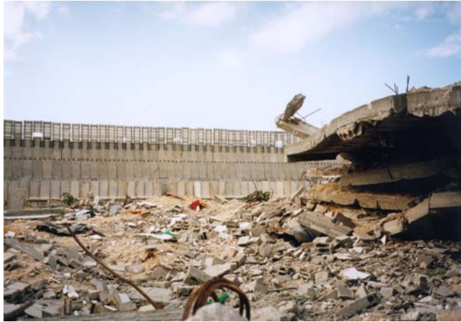
Destroyed houses in Khan Yunis refugee camp, near the Israeli settlement of Neve Dekalim (Gush Katif settlement bloc), in the Gaza Strip. © AI, November 2002

The Israeli army spokesperson's office issued different statements according to which the demolished houses: " served as cover for gunmen's fire ", " were suspected of serving as cover for tunnels used weapon in smuggling operations "; or were targeted " in response to the terrorist attack that killed an IDF officer and three soldiers. " 29