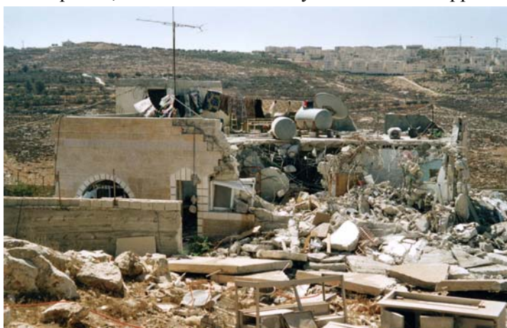
This house in Beit Hanina (East Jerusalem), home to the Badr family, was destroyed on 11 September 2001. The demolition reportedly stopped when the soldiers realised they were destroying the wrong house. In the background the Israeli settlement of Reches Shu'fat.

Since annexing East Jerusalem Israel has severely limited new construction in the Palestinian neighbourhoods. The expropriation of large areas of land near Palestinian neighbourhoods and villages left most Palestinian neighbourhoods with little or no land on which to build, and where there is land it is not permitted to build on it. Whereas in the rest of the West Bank the Israeli authorities have cited ancient plans which give no opportunity for development, in East Jerusalem they have done the opposite. Shortly after annexation in 1967