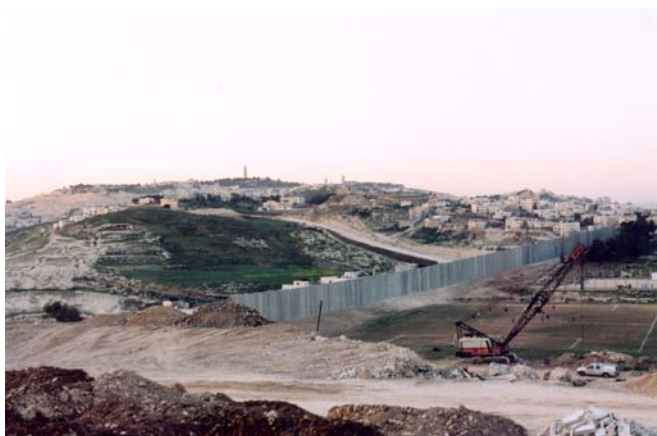
Construction of the concrete wall in Abu Dis, East Jerusalem, March 2004.

depths. To date less than half of the route has been completed, mostly in the northern regions of the West Bank and around Jerusalem. In addition to the large areas of particularly fertile Palestinian farmland that have been destroyed, other larger areas have been cut off from the rest of the West Bank by the fence/wall. According to the Israeli authorities the fence/wall is intended to block entry into Israel to Palestinian suicide bombers and other potential attackers. However, the fence/wall is not being built between Israel and the Occupied Territories but