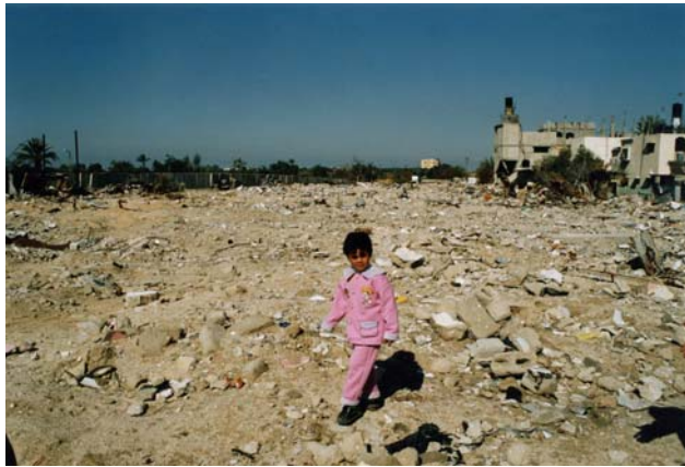
House demolition in Rafah, near the border with Egypt. ©AI, February 2002

The already poor sewage system was further damaged by the Israeli army tanks and bulldozers, along with water mains and electricity and telephone lines. The Israeli army stated that during the operation it had uncovered three tunnels used by Palestinian armed groups to smuggle weapons from Egypt to the Gaza Strip. 25 In the preceding six weeks some 50 other houses were also demolished in Rafah, leaving hundreds more Palestinians homeless.